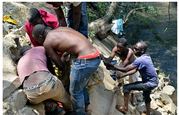
The body of an illegal miner is being pulled out of an illegal gold mine near Johannesburg.